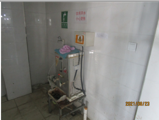
inspection and packing