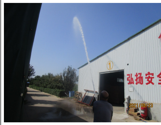
Fire hydrant testing