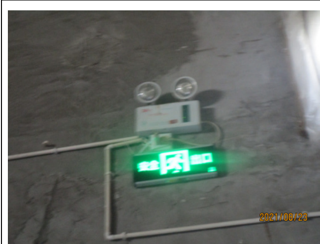
Emergency light and sign