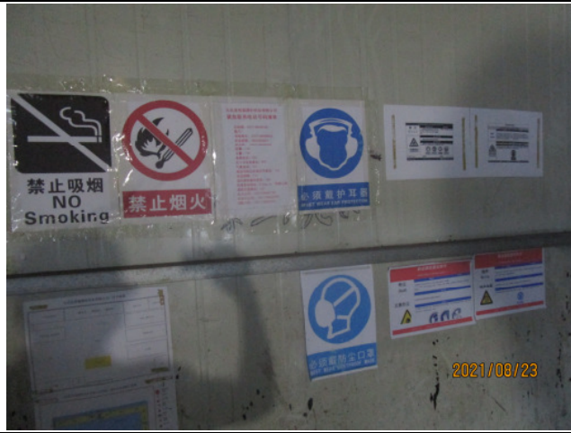
PPE warning sign