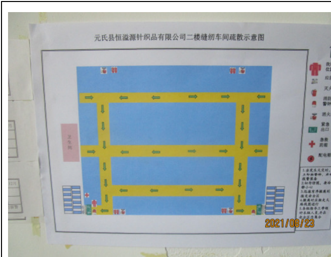
Fire emergency evacuation map