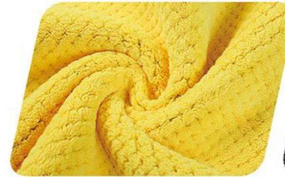
Pineapple Grid Surface