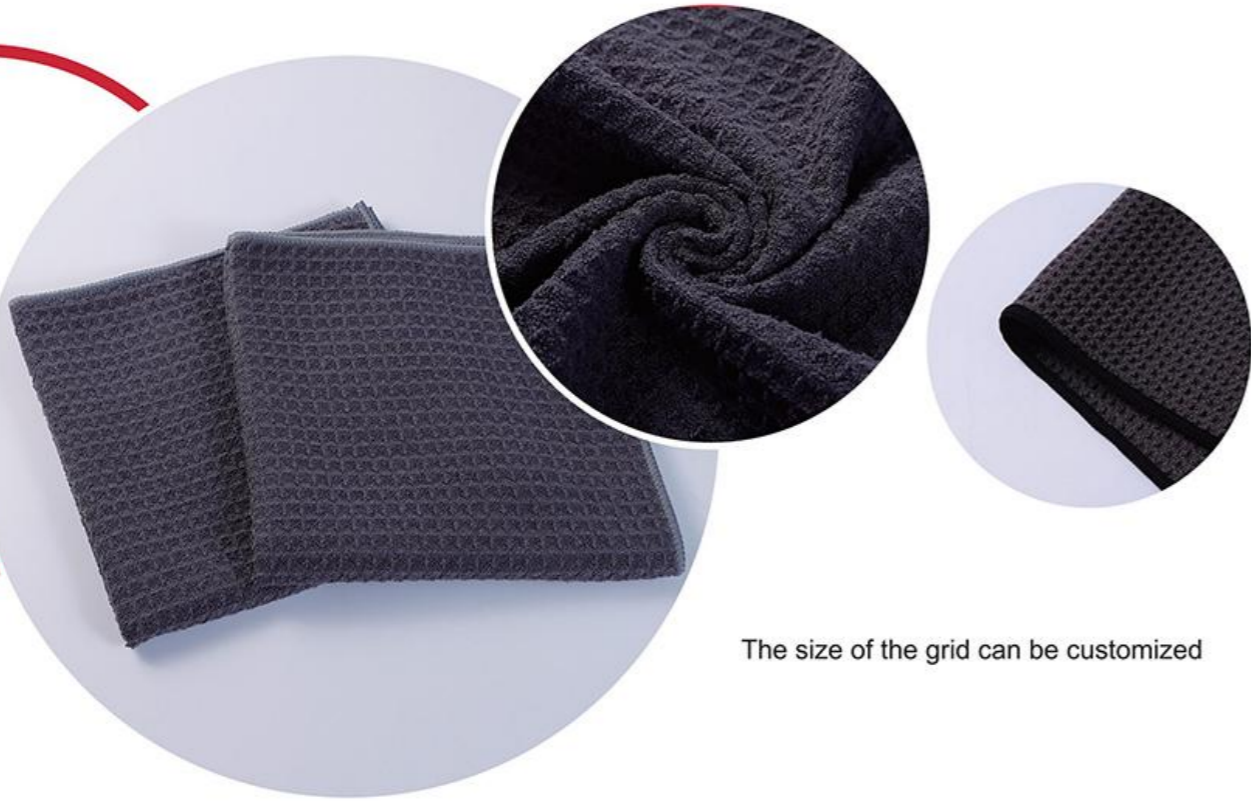
The size of the grid can be customized